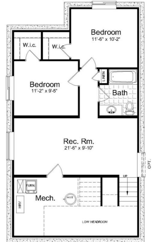
Optional Finished Bsmt. Layout 611 sq. ft. (finished space)

Actual plan may vary from brochure. This plan is published by Hilton Homes. Dimensions and square footage shown are approximate and subject to change without notice. Elevations may show optional features for artistic purposes. Please ask your sales representative for more information.