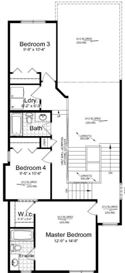
Upper Floor Plan 850 sq. ft.