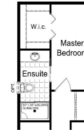
Opt. Upper Floor Plan ~ Deluxe Ensuite ~ 853 sq. ft.