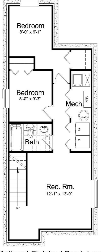
Optional Finished Bsmt. Layout 528 sq. ft. (finished space)

Actual plan may vary from brochure. This plan is published by Hilton Homes. Dimensions and square footage shown are approximate and subject to change without notice. Elevations may show optional features for artistic purposes. Please ask your sales representative for more information.