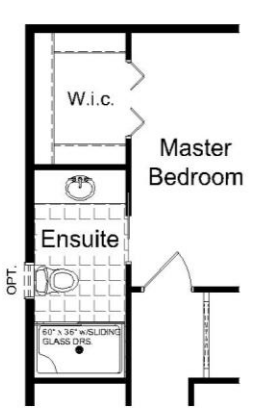
Opt. Upper Floor Plan ~ Deluxe Ensuite ~ 853 sq. ft.