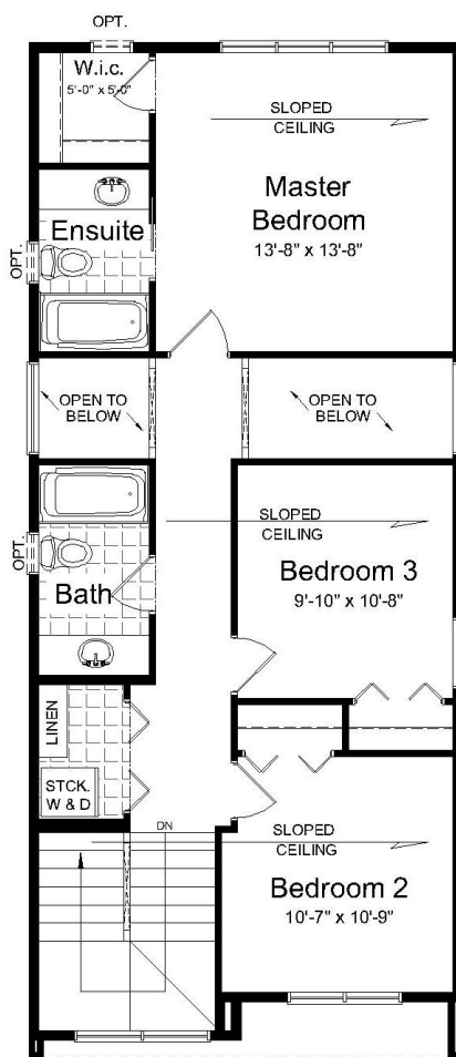
Upper Floor Plan 829 sq. ft.