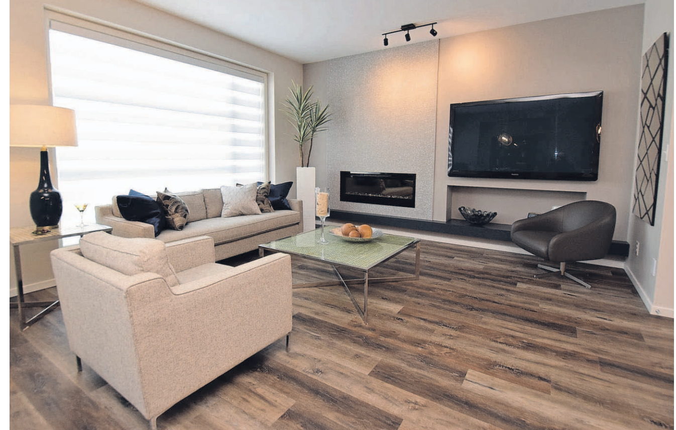
The family room's focal point is a linear electric fireplace with a grey terrazzo-style tile feature wall.

In a savvy design move, the primary bedroom was placed on the opposite side of the bonus room to set it well