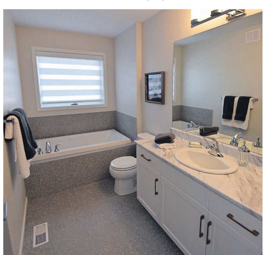
Filled with rich finishes, the ensuite is a luxurious, spa-like space.