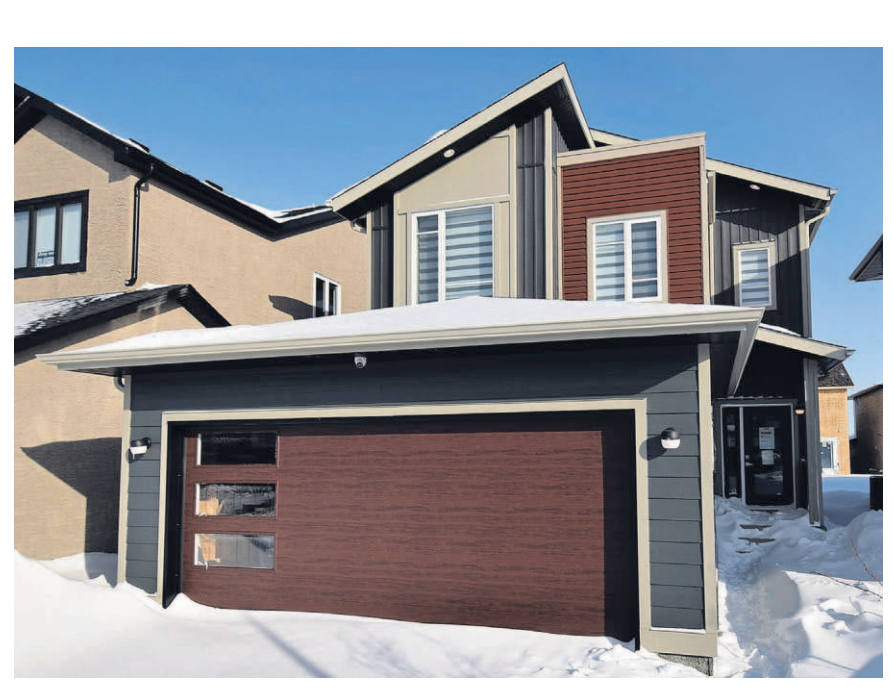
This striking yet sensibly-designed home offers families the utility and style they need in today's new reality.