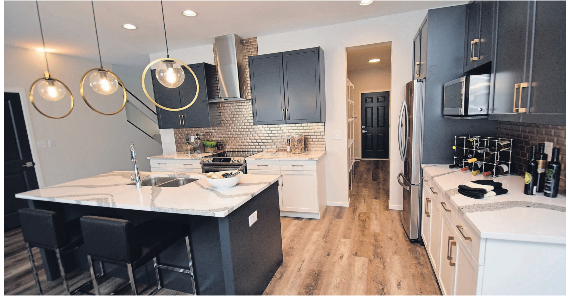
The island kitchen features quartz countertops, a gold ceramic tile backsplash, modern grey cabinetry and a walk-through pantry.