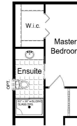
Opt. Upper Floor Plan ~ Deluxe Ensuite ~ 853 sq. ft.