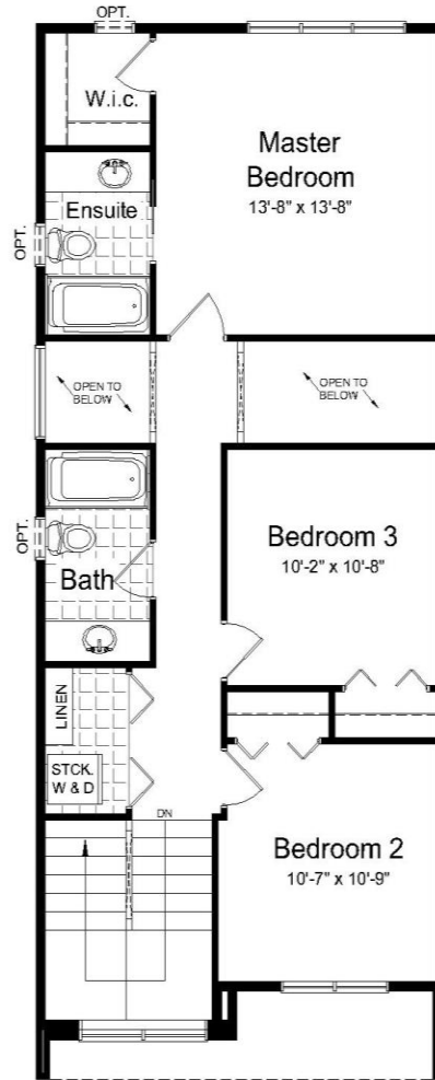
Upper Floor Plan ~ 829 sq. ft.