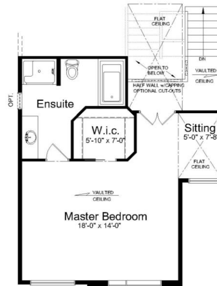
Upper Floor Plan ~ Deluxe Ensuite 593 sq. ft.