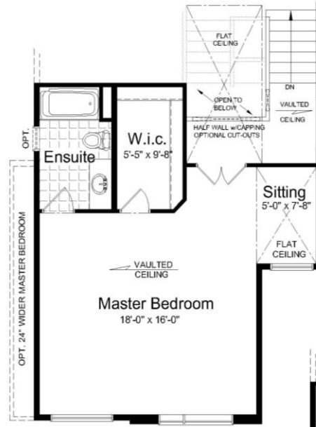
Upper Floor Plan 593 sq. ft.