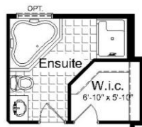
Deluxe Ensuite - 1543 sq. ft.