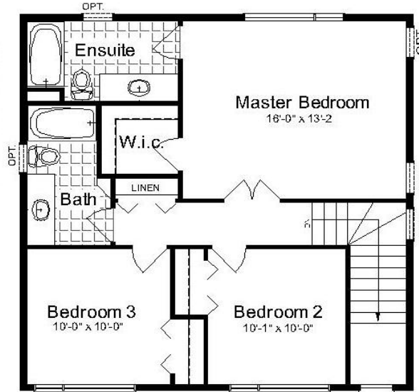
Upper Floor Plan 764 sq. ft.