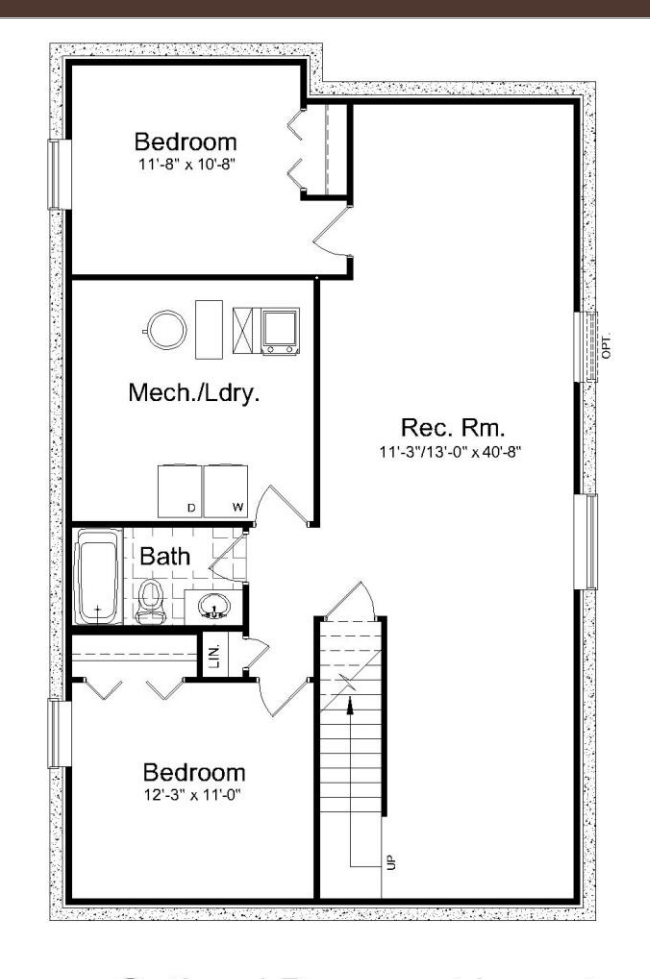
Optional Basement Layout 923 Sq. ft. (finished space)

Actual plan may vary from brochure. This plan is published by Hilton Homes. Dimensions and square footage shown are approximate and subject to change without notice. Elevations may show optional features for artistic purposes. Please ask your sales representative for more information.