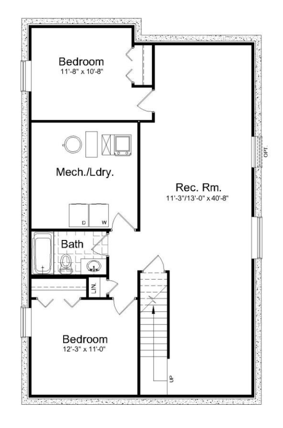
Optional Basement Layout 923 Sq. ft. (finished space)

Actual plan may vary from brochure. This plan is published by Hilton Homes. Dimensions and square footage shown are approximate and subject to change without notice. Elevations may show optional features for artistic purposes. Please ask your sales representative for more information.