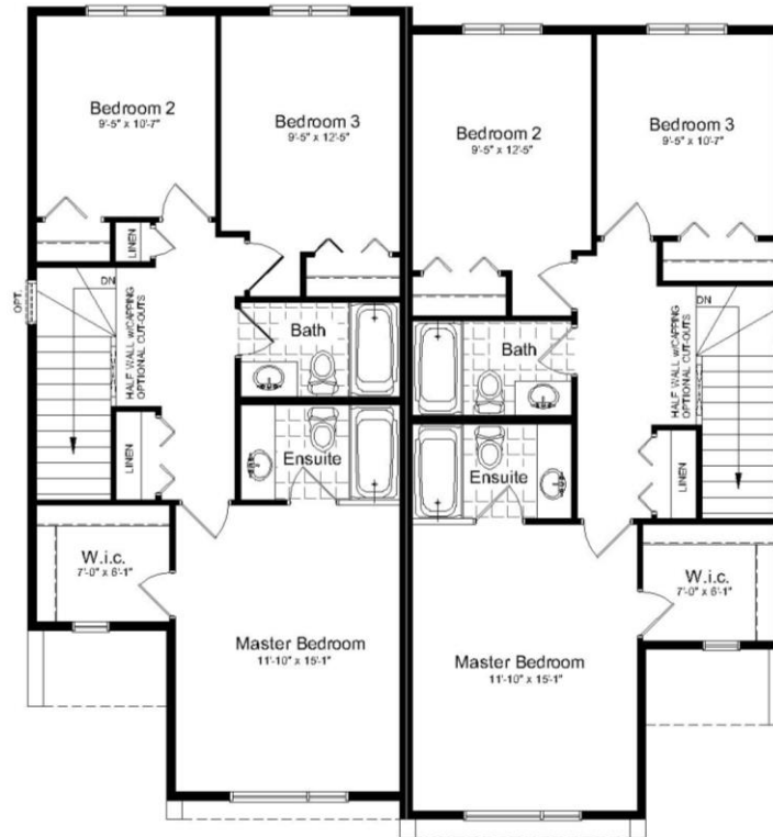
Upper Floor Plan 774 Sq. ft. (ea. unit)