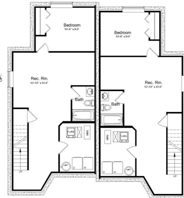
Optional Basement Layout 515 Sq. ft. (finished space ea. unit)

Actual plan may vary from brochure. This plan is published by Hilton Homes. Dimensions and square footage shown are approximate and subject to change without notice. Elevations may show optional features for artistic purposes. Please ask your sales representative for more information.